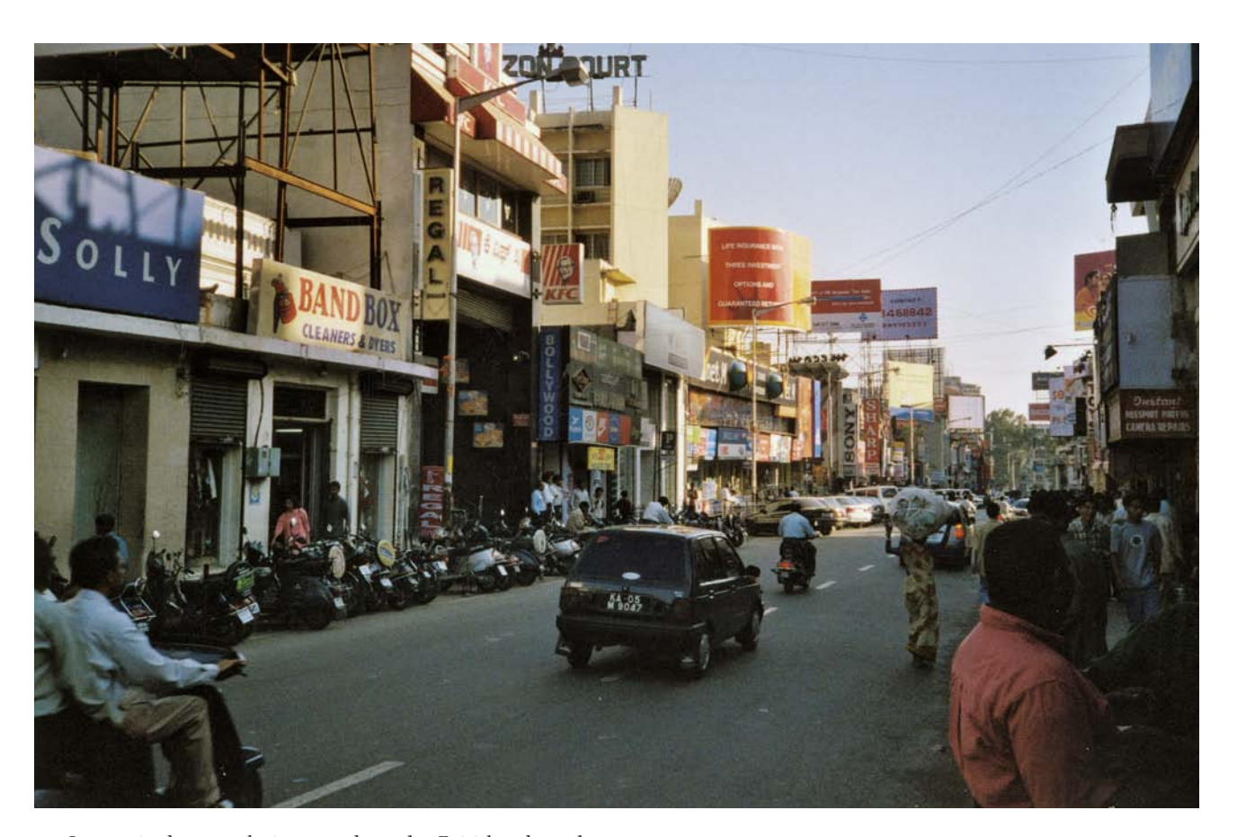
Above: Brigade Road, downtown Bangalore, with KFC on the left.

Interestingly enough, it was only under British rule and as a consequence of the British administrative system that caste distinctions became so well defined. The formerly fluctuating laws that arose out of daily practice were turned into rigid proscriptions. With the growing bureaucratic rule of the British Empire came its efforts to "rank and grade Indian social orders."2 Hierarchy had always existed, but now it was no longer loosely defined and administered.